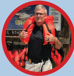
X Not Buckled