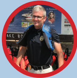
X Too Small