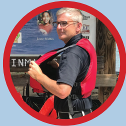
X Too Big