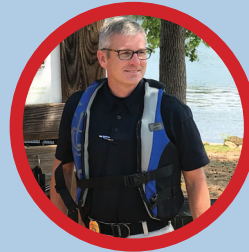
X Buckled Incorrectly